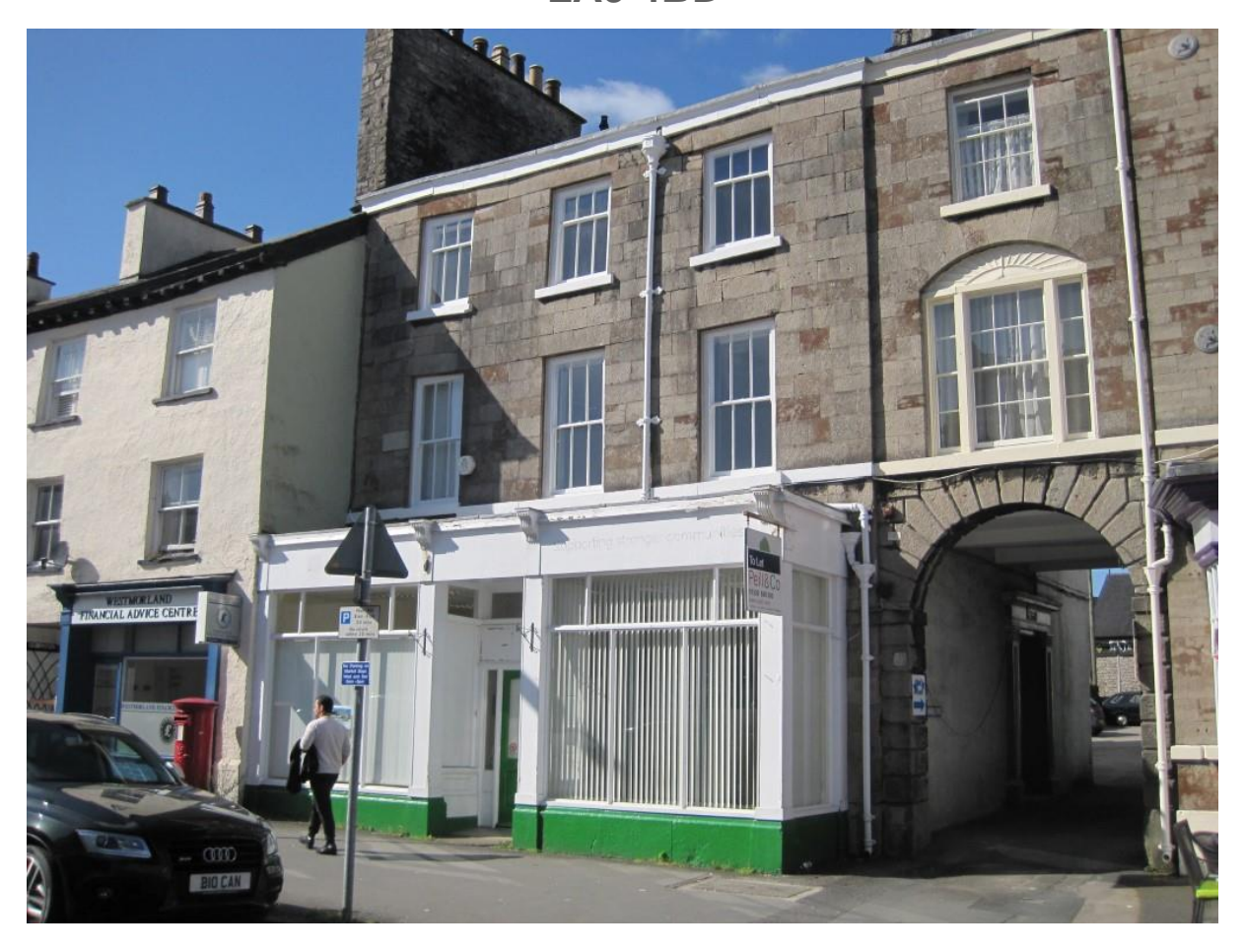
Impressive listed building suitable for a range of uses, or potential conversion to residential.

Kendal is an attractive market town situated in south Cumbria with a resident population of approximately 25,000 but which draws on a much wider catchment incorporating surrounding towns and villages. Kendal is the administrative centre for South Lakeland and is situated approximately 8 miles from access to the M6 motorway at junction 36, 8 miles from Windermere, 22 miles north of Lancaster, 26 miles south of Penrith and 52 miles south of Carlisle. The town has the benefit of a mainline railway station at Oxenholme on the