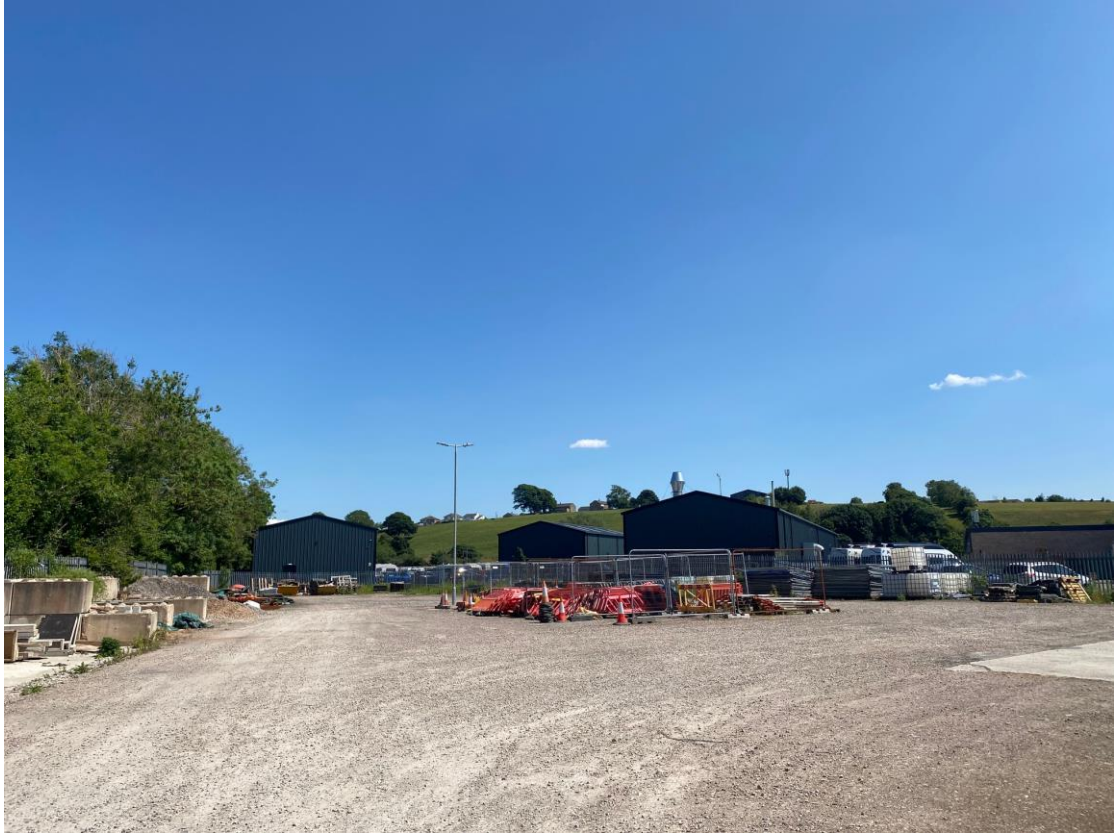
Adjacent yard (available separately)

Peill & Co Ltd on their behalf and for the sellers or lessors of this property whose agents they are give notice that: (i) The particulars are set out as a general outline only for guidance of any intending purchasers or lessees and do not constitute, nor constitute part of an offer or contract. (ii) All descriptions, dimensions, references to condition and necessary permissions for use and occupation, and other details are given in good faith and are believed to be correct, but any intending purchasers or tenants should not rely on them as statements or representations of fact, but must satisfy themselves by inspection or otherwise as to the correctness of each of them. (iii) No person employed by Peill & Co Ltd has any authority to make or give any representation or warranty whatever in relation to this property. Unless otherwise stated, all prices and rents are quoted exclusive of VAT. All details, plans, maps and photographs are for identification only and are believed to be correct at the time of printing. Shop occupiers are subject to change.