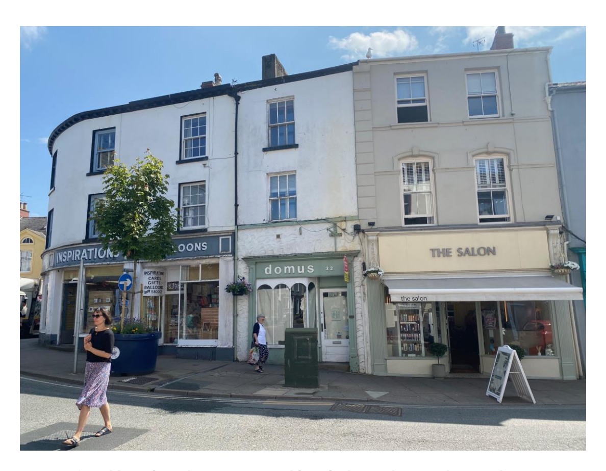
Good location close to car parking, independent traders and restaurants/bars

32 King Street Ulverston Cumbria LA12 7DZ