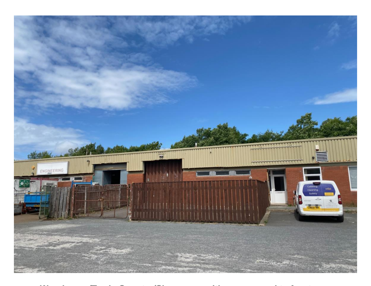
Warehouse/Trade Counter/Showroom with secure yard to front.

Unit 1E Ashburner Way Walney Road Industrial Estate Barrow-in-Furness Cumbria LA14 5UZ