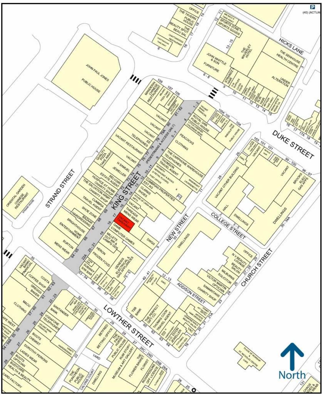
Plan for identification purposes only

Peill & Co Ltd on their behalf and for the sellers or lessors of this property whose agents they are give notice that. (i) The particulars are set out as a general outline only for guidance of any intending purchasers or lessees and do not constitute, nor constitute, part of an offer or contract. (ii) All descriptions, dimensions, references to condition and necessary permissions for use and occupation, and other details are given in good faith and are believed to be correct, but any intending purchasers or tenants should not rely on them as statements or representations of fact, but must satisfy themselves by inspection or otherwise as to the correctness of each of them. (iii) No person employed by Peill & Co Ltd has any authority to make or give any representation or warranty whatever in relation to this property. Unless otherwise stated, all prices and rents are quoted exclusive of VAT. All details, plans, maps and photographs are for identification only and are believed to be correct at the time of printing. Shop occupiers are subject to change.