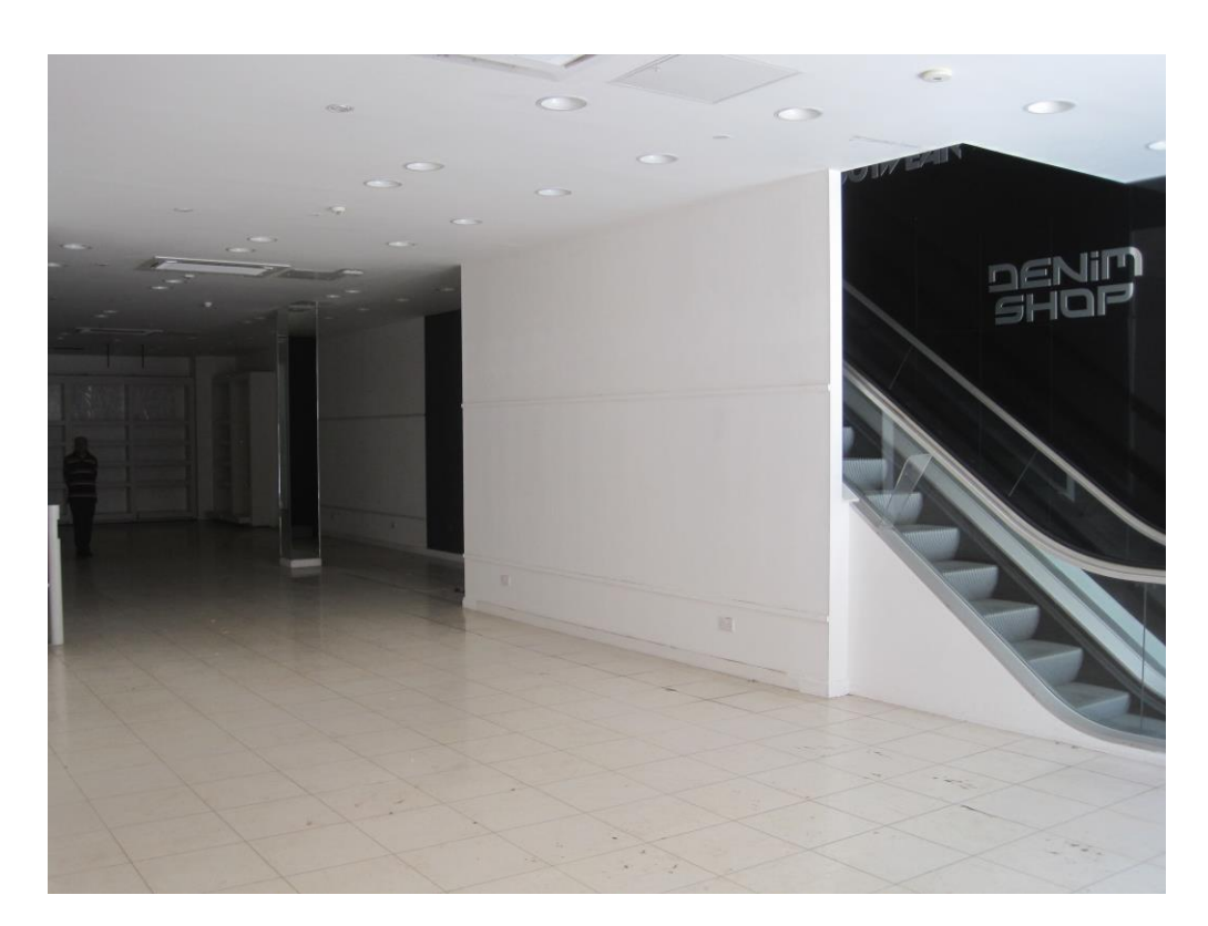
NB. Escalator to be removed

IMPORTANT NOTICE RELATING TO THE MISREPRESENTATION ACT 1967 AND THE PROPERTY MISDESCRIPTIONS ACT 1991