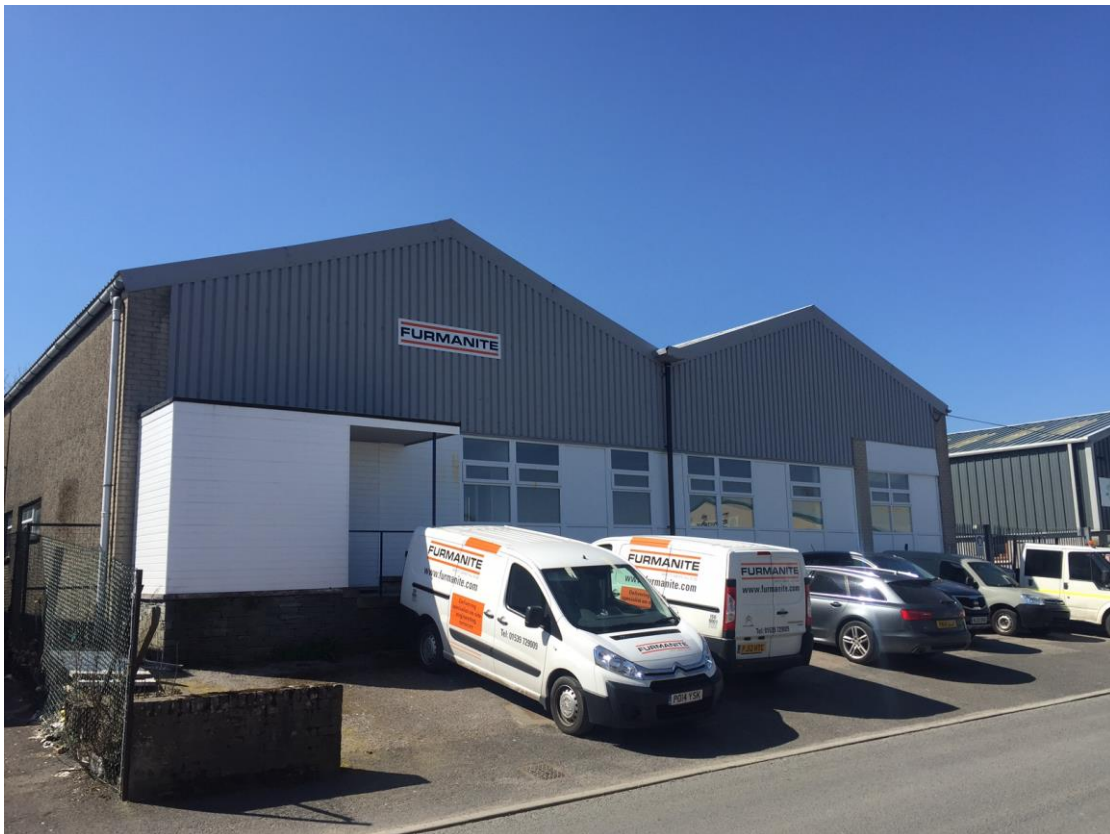
Trade counter/warehouse with good circulation space to let on new lease

Former Furmanite Mintsfeet Road North Kendal Cumbria LA9 6LZ