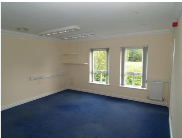
Office No 1

Modern high spec serviced ground floor office accommodation with car parking